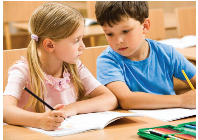
The State Treasurer and Oregon Investment Council invest the Common School Fund. In recent years, fund values have ranged from $600 million to more than $1 billion, depending on market conditions. The current value of the fund is approximately $930 million.

"Every dollar helps Oregon schools – it's just that simple," says Solliday. "My goal is for every education advocate across the state to understand the Common School Fund and the Department of State Lands' role in supporting Oregon's schoolchildren from generation to generation."